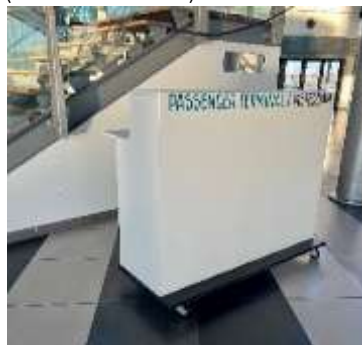
12x PTA desk 70 cm x 146 cm, 103/132 cm high (board is 150 x 118)