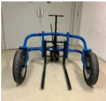
2x Pallet trucks air tires