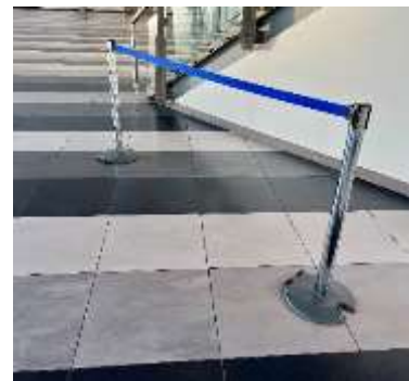
Stanchions 3 meter