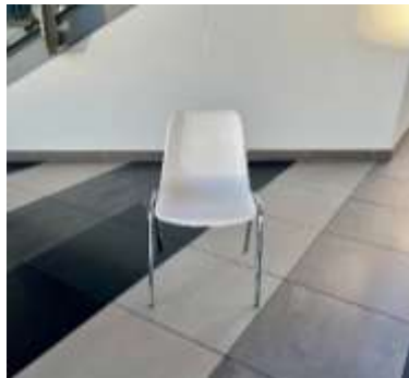
800x Chairs height: 78 CM seat: H 44 CM x B 40 CM x D 40 CM back: 42 CM