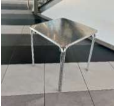
25x Aluminum table, square 70 cm x 70 cm x 70 cm